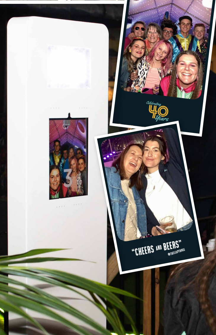
PHOTO BOOTH HIRE

Available for your whole event our high quality photo booth is a great way to capture memories and have them for a lifetime.